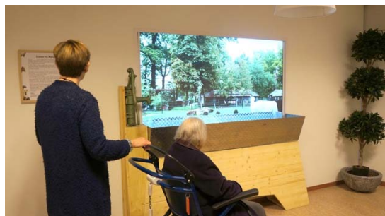
Figure 3: Setup for Prototype (II).

Prototype (II) was built up and exhibited inside a care home, taking up the space of a meeting room at the end of the hall way on the ground floor, and open to the public.