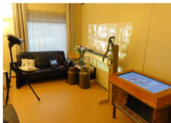
Figure 2: Set up for Prototype (I).

The first prototype (Figure 2) was built up with a need to be constructed and deconstructed easily, since it needed to be tested in 3 different care homes. The wood structure of the trough was made in a simple and flexible style, and a projector was used to present the farm scene instead of a big screen.