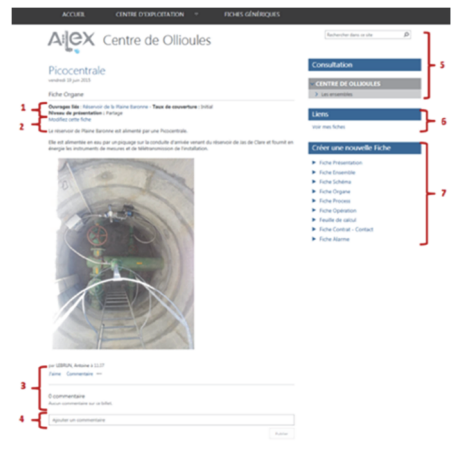
Figure 2: View page of a content form.

Several pieces of information were proposed as representative of reflexive indicators: notifications of new publications, authors and date of submission, last sheets read, view of contribution status, number of comments received on a sheet. The view of publications and number of comments did not trigger any discussion as they have been already discussed in previous sessions (see Figure 2 zone 3,4). Notifications of new contributions published or consulted were mentioned to facilitate the identification of recent information and the interests of other collaborators. The identification of the actors. such as the last contributor or the last reader, was deemed useful for initiating direct discussions between colleagues. However, the identification of the successive contributors was not considered necessary, a validated form being considered as a collective work. The status of publications (pending, rejected, and accepted) has emerged due to the expressed need to know if and when the validator has taken into account a contribution. Finally, by considering possible use cases, the discussions revealed two ways of presenting these indicators: in a personal page linked to profiles (see Figure 2 zone 6 for access) and on COs front pages. The first page was seen as a way for each collaborator to follow his / her