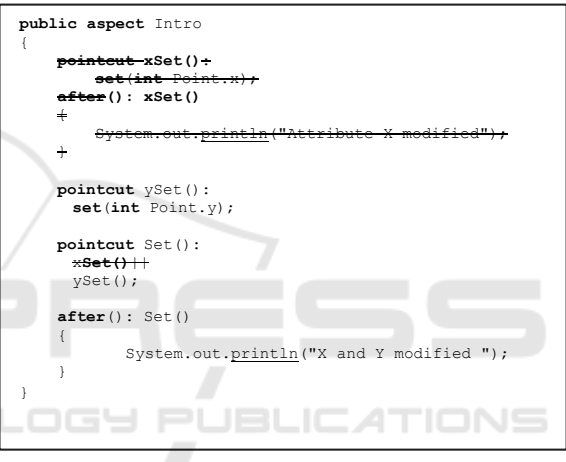
Figure 5: Example of impact rule: removal of pointcut.