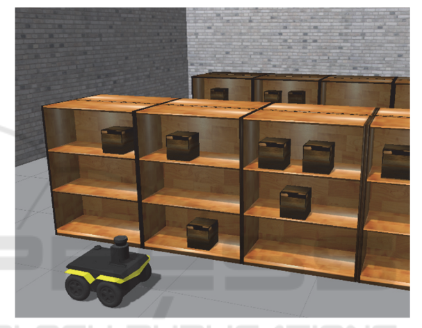
Figure 2: The simulated storage area with the robot.

In addition to the visual interface the ROS simulator provides also several robotic components for sensor input, robot movement, route planning and navigation etc. These are used by application agents to perform various tasks in the pilot scenario.