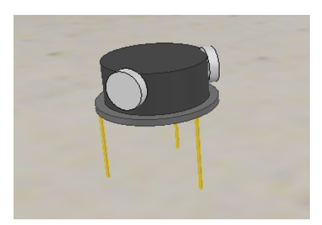
Figure 1: Graphical visualisation of the Kilobot robot in V-Rep simulation software.

tances between neighbours as feedback, the robot's movement can be corrected, as well as being used to promote the use of collective behaviours (Rubenstein et al., 2012).