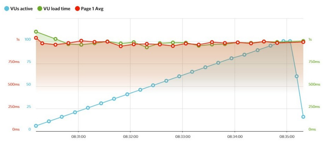
Figure 2: Load Impact-test after the optimization.