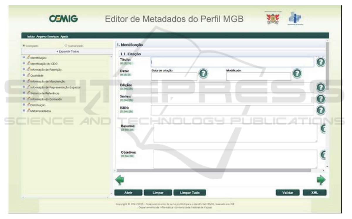
Figure 1: edpMGB's home screen.

The button "Validar" (Validate) performs one of the system's main features, which is to validate whether the metadata is in accordance with the XML schema of the MGB profile. When the button is clicked, the system verifies the data input and may display, for instance, a dialog box as shown in Figure 3 to inform that the metadata does not respect the MGB profile's rules. The dialog box displays an error log alerting the user and showing which fields are not in accordance with the rules. The user may keep editing the metadata or store it in his or her machine even if it is not validated for the MGB profile. When a non-validated metadata is generated, it is tagged informing it does not conform to the MGB profile.