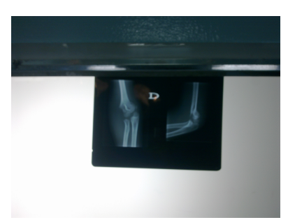
Fig. 2. The fracture's radiographs.