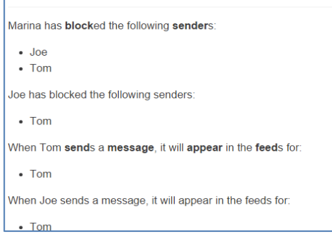
Figure 2: Annotating Domain Concepts.

We can enrich this specification in several ways. We shall give the following methods: