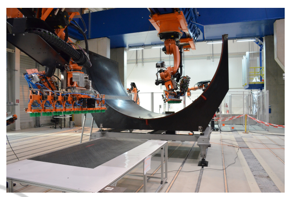
Figure 1: The experimental setup for the layup in the multifunctional cell.

The VARI process basically uses dry textile cutouts laid into a mold at specific positions. Afterwards the mold is sealed with an airtight foil and other auxiliary materials. The whole layup is then evacuated and subsequently infused with resin. To fully leverage the weight saving potential of CFRPs, fibers are mainly oriented along the major axis of tensile loads. In other words, more material is placed in areas where high loads are expected and less in other areas. Ultimately, this leads to a very complex design of cutouts - often referred to as cutpieces - in which many cutpieces are unique within the layup. The whole layup is documented in a plybook<sup>1</sup> which specifies the shape of each cutpiece and where it should be placed in the layup. In aerospace applications, these plybooks usually contain hundreds of individual cutpieces.