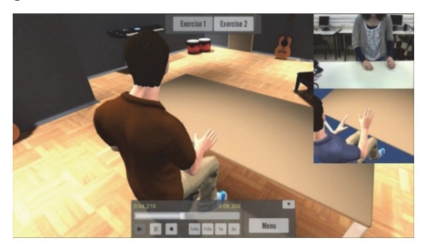
Figure 6: Practice Screen: Isometric View of 3D Learner Avatar (Big Central Window), Animation Controller (Bottom Center), Expert Video (Top Right), Close-up Expert Hands (Center Right).

The musical game activities include observe and practice phases. In the observe phase, the learner can observe the video of an expert performing a musical gesture.