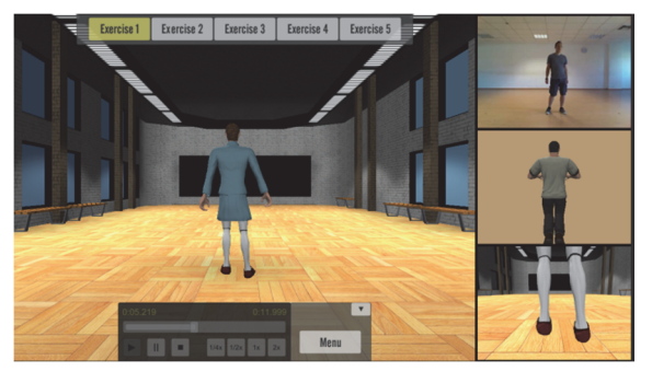
Figure 3: Practice Screen: Backward View of 3D Expert Avatar (Big Central Window), Animation Controller (Bottom Center), Exercise Indicator (Top Center), Expert Video (Top Right), 3D Learner Avatar (Center Right), Backward View of Close-up Expert Legs (Bottom Right).

If the imitation is completed properly, the learner can proceed to the next exercise. Otherwise, the learner is expected to repeat the same exercise till s/he does the moves correctly. Although the exercises progress sequentially, in some cases the learner has to