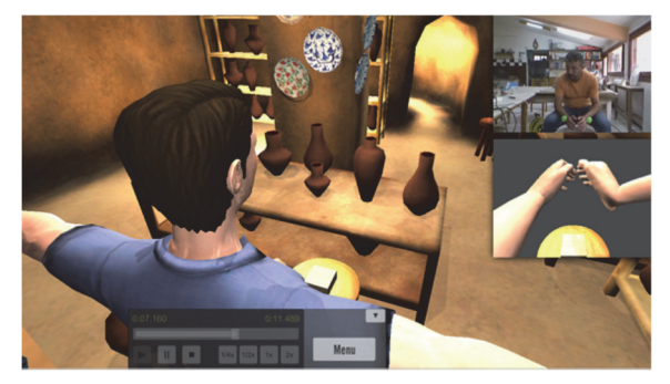
Figure 4: Practice Screen: Angled View of 3D Learner Avatar (Big Central Window), Animation Controller (Bottom Center), Expert Video (Top Right), Close-up on Expert Hands (Center Right).

The application communicates with the Body and Gesture Data Capture and Analysis Module that is