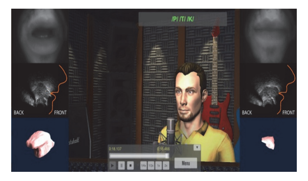
Figure 2: Practice Screen HBB Game.

The learner should practice each activity a number of times, and finally perform all the activities at once. The practice screen of the HBB game is illustrated in Figure 2.