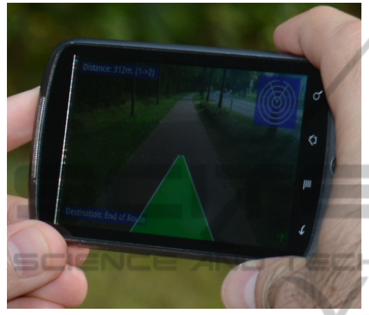
Figure 1: Visual directional cues augment the video feed of the rear camera on the smartphone's display, letting the user perceive both the environment and the guidance at the same time.

Visual direction cues were presented as virtual arrows or paths superimposed on the rear camera feed, showing an augmented view of the path as depicted in Figure 1. Auditory and tactile direction cues were presented as spoken directions and vibration patterns, respectively. Based on the results of (Vainio, 2009), we designed our system to provide continuous rhythmic feedback to guide the user in the navigation task.