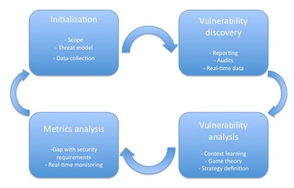
Figure 1: Proposed framework for vulnerability assessment in an adaptive quantitative approach.

In this section, a framework for vulnerability analysis is presented. This framework is adapted for a quantitative risk analysis approach in order to be integrated in an adaptive security model. Figure 1 details the process of the framework. Inspired from the PDCA cycle, this framework is adapted to