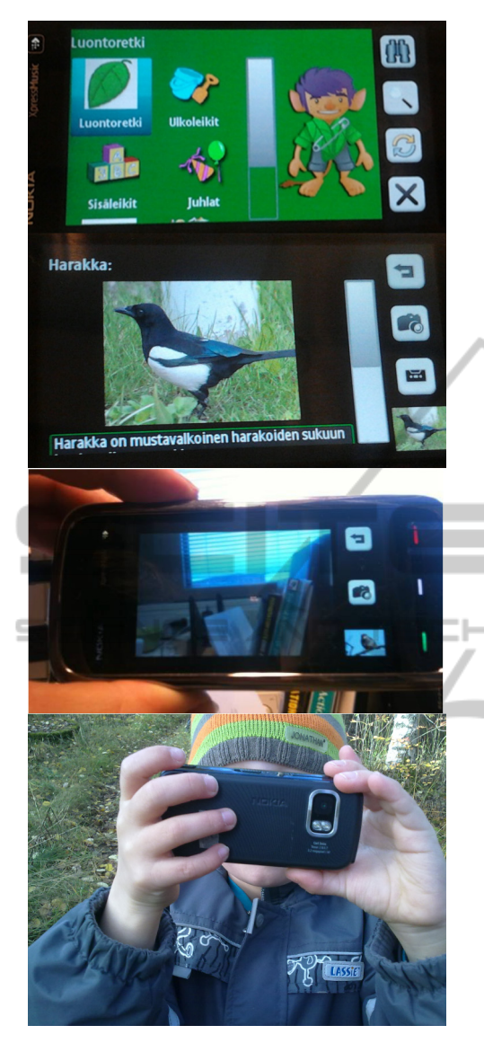
Figure 2: The screen captures of the application (the opening view, relevant information about the species, taking a photograph, and child recording observation).

phenomena have been observed across the country. For example, one group from southern Finland and another group from northern Finland can record their observations and make comparisons.