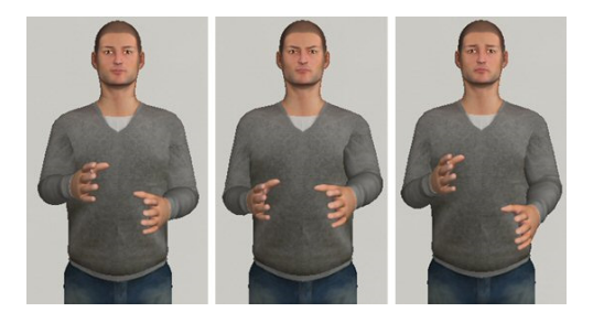
Figure 2: The same sign with different emotions. From left to right: neutral, angry and sad.

Thus, the final result is the virtual interpreter signing with very realistic movements. The execution of the signs, as well as facial expression, is modified depending on the emotion. Figure 2 shows the same sign executed with different emotions.