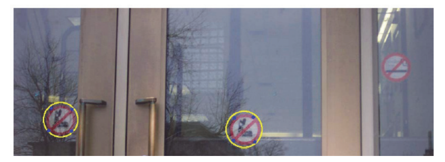
Fig. 1. Error detection in sign detection based on color information.

The approach to the detection of signs that is based on the color filtering does not require a lot of computing resources. This explains the popularity of this approach in the early 1990s until 2006 [8]. However, the accuracy of this approach is insufficient / too low. A good example of one of the three signs which is "not red enough" in terms of using color filtering, is shown in Figure 1.