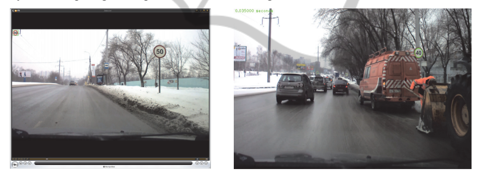
Fig. 4. Detection and recognition of the traffic sign.