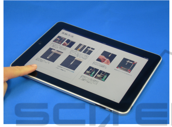
Figure 3: Prototype electronic textbook.

We tried to produce electric textbook for chemical laboratory (Figure 3), which integrates the observable level experiment and the molecular world.