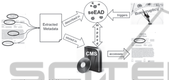
Figure 1: Obligation management overview.

information, i.e. contract metadata to business objects described in an enterprise ontology. In the ontology (background) knowledge about business objects and business events are made explicit. Hence, this knowledge can be used to automatically assess business events, for example reported in external sources of commercial information or newspaper reports, and to identify affected obligations for which the respective contract(s) can be retrieved.