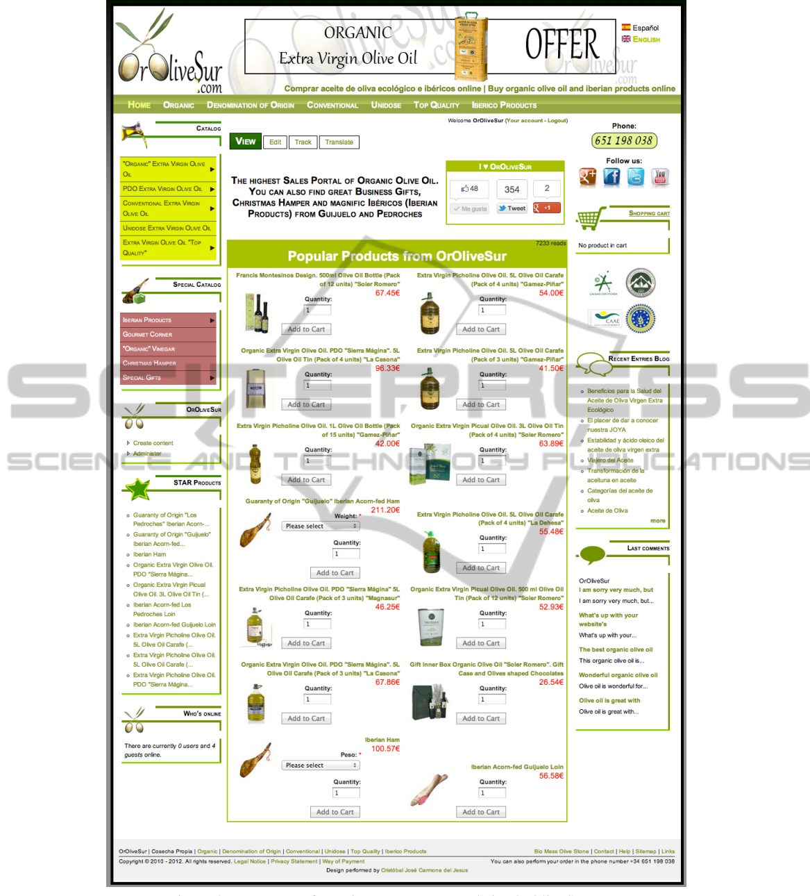
Figure 2: Homepage from the e-commerce website OrOliveSur.com.

an English (http://en.orolivesur.com) and Spanish (http://www.orolivesur.com) version. In Fig. 2 the homepage of OrOliveSur is shown.