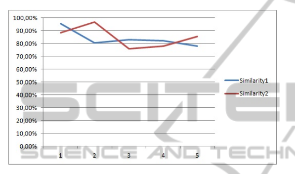
Figure 7: Variation in the degree of similarity in the experiments.

Figure 7 presents the variation of the degree of similarity found in the analysis of the five discussion forums. Graphic "Similarity1" corresponds to the degree between the averages obtained from Teacher 1 and from MineraFórum. Graphic "Similarity2" refers to the comparison with Teacher 2.