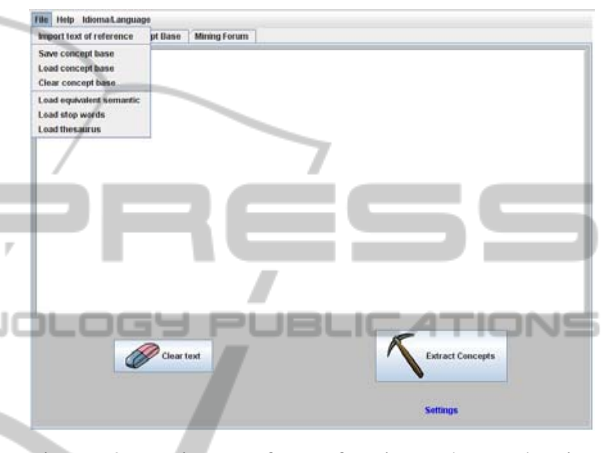
Figure 2: Main Interface of MineraFórum showing selection of the "File" menu.

MineraFórum is a program that makes qualitative analysis of posts in discussion forums. It was developed at NUTED<sup>iii</sup>/PGIE/UFRGS. At present, version 3.0 of the software is being used. This program is capable of calculating the relevance of each post within a particular discussion. To analyze the content of text contributions, the program uses the text mining using graph technique. Figure 2 presents the main interface of MineraFórum.