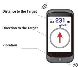
Figure 1: User Interface

Figure 1 shows the interface of this system. There is the compass on the center of the display and there is the numerical value of distance above the compass. In addition while the device is turning in a correct direction, the device vibrates.