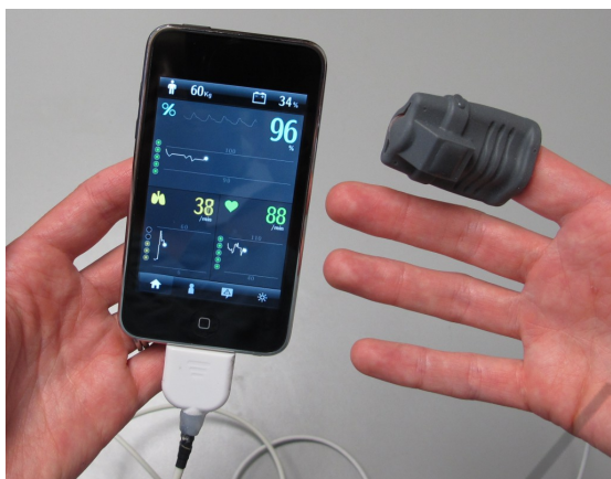
Figure 1: First prototype of the Phone Oximeter.

used anywhere. Indeed, our innovative use of a mobile phone platform takes advantage of the already widespread distribution of these phones across the developing world. While pulse oximeters have been previously connected to mobile phones (Black et al., 2009; Moron et al., 2005), they have not been designed for use in the OR, do not meet current pulse oximeter design standards, nor do they include a goal oriented interface design. In addition, specific phone and language requirements limit the accessibility of these designs to the developing world.