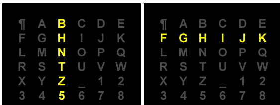
Figure 1: Typing matrix of the Mind Speller. Rows and columns are flashed in random order; one trial consists of flashing all six rows and all six columns. The intensification of the third column (left panel) and the second row (right panel) are shown.

for healthy subjects. It, thus, remains to be seen how the comparison will look like for disabled subjects, and how this will affect the choice of the best classifier. This is indeed an important question since the P300 responses from healthy subjects and disabled patients can be quite different (Sellers and Donchin, 2006). Thus, the results of the classification performance comparison for healthy subjects could possibly not be valid for disabled ones. In addition, the outcomes of the comparison, performed on healthy subjects, also lead to slightly different conclusions. In (Krusienski et al., 2006) a comparison of several classifiers (Pearson's correlation method, Fisher's linear discriminant analysis (LDA), stepwise linear discriminant analysis (SLDA), linear support-vector machine (SVM) and Gaussian kernel support vector machine) was performed on 8 healthy subjects. It was shown that SLDA and linear SVM render the best overall performance. In (Mirghasemi et al., 2006) it was shown that, among linear SVM, Gaussian kernel SVM, multi-layer perceptron, LDA and kernel LDA, the best performance was achieved by LDA. Based on these studies, albeit different sets of classifiers were used in the comparison, one can conclude that linear classifiers work better than nonlinear ones, at least for the P300 BCI. This statement is also supported by other researchers ( e.g. , in (Lotte et al., 2007)).