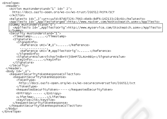
Figure 6: Modified 'AppliesTo' element.

The figure 6 shows the token service response after modification. Issuing service has included "AppliesTo" element in signature calculation. In this attack, an attacker changes "AppliesTo" element of a response so that the client discards obtained security token and there won't be any context establishment with the Web Service. An attacker would add a Dummy node qualified with "mustUnderstand=0" and move original "AppliesTo" element inside it. The signature verification would be successful as original "AppliesTo" element is still present though it has been moved inside Dummy node. However, an injected new "AppliesTo" element no longer points to the web service for which token was requested (Forged node points to http://www.Hacker.com/NoStockWatch.asmx web service). The token requestor would discard the token since it didn't receive token corresponding to the asked (http:// service it for www.myservice.com/StockWatch.asmx).