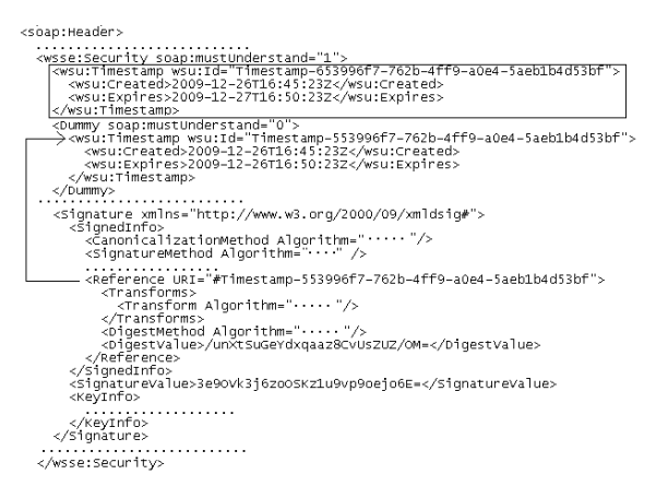
Figure 2: Signature section of stale message.

As shown in figure 2, we injected a new Timestamp node immediately under Security element. "Expires" element bears the value one day ahead in future. We wrapped original Timestamp element inside Dummy node qualified with "mustUnderstand=0". The Signature section refers to the original timestamp element whose id equals "Timestamp-553996f7-762b-4ff9-a0e4-