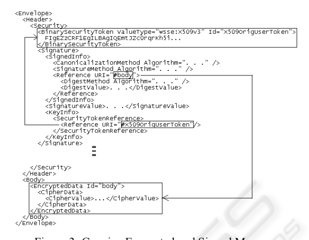
Figure 3: Genuine Encrypted and Signed Message.

Assume that the message is encrypted first and then signed. Let's assume an online marketing company that sells products online. There are several registered sellers who sell goods through the aforementioned company. Company has made a provision for these sellers to upload details of their products they offer through a Web Service. Also, each registered supplier is provided a digital certificate. All the sellers have a copy of the digital certificate of the marketing company with them. The Body of a SOAP message contains product details which are encrypted with the public key of an online marketing company so that it is not legible to unintended recipients.