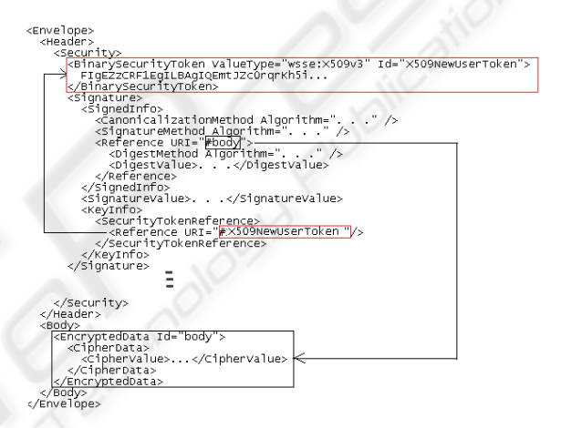
Figure 4: Message with modified Signature.

Figure 3 shows a genuine message sent by a seller whose certificate is identified hv 'X509OrigUserToken'. Now, let's assume that there exists a seller with mala fide intentions who possesses a digital certificate identified as 'X509NewUserToken'. The malicious seller captures SOAP message sent by the other seller and removes a signature node from the security header and embeds his own signature node to sign original message body using his own key as shown in the figure 4. On processing this message, server assumes as if message has arrived from the malicious seller because the key used for signature points to the malicious seller's certificate.