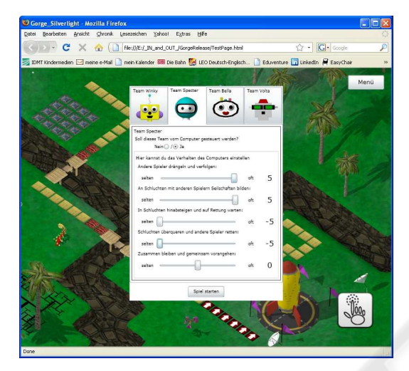
Figure 1: For every AI adversary, characteristics may be set.

Next, the players must be introduced into the easy opportunities they have to set up and control AI.