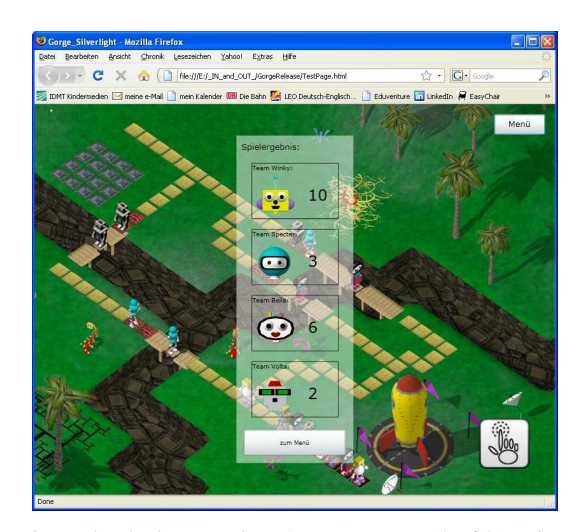
Figure 4: The human player's team scores 10 of 21 points.

The game reported throughout the present section has been ending with the human player's–in fact, the author's–victory (gaining 10 points out of 21 in total; see figure 4) demonstrating the tactic's success.