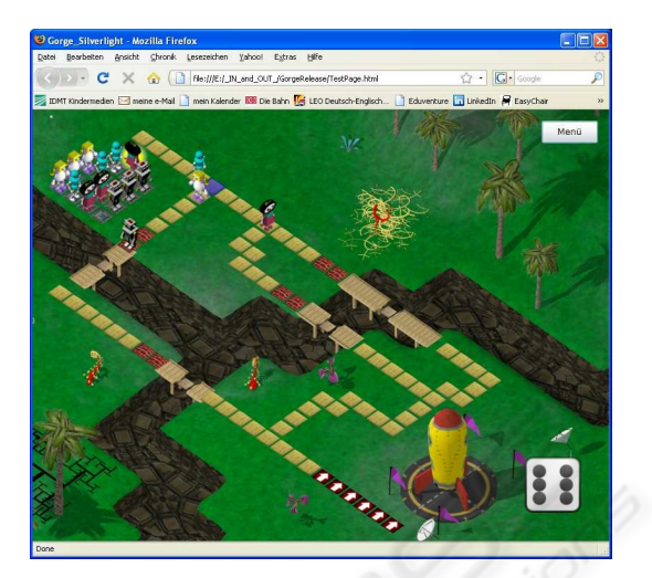
Figure 2: It is a big fun to play with and fool an NPC's AI.

As a result, agressive players are preferring this path. They find opportunities galore to jostle each other. Meanwhile, the human player finds a separate way (see figure 3 above) where not much struggling is ongoing.