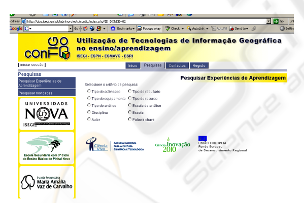
Figure 1: The ConTIG web page.

The ConTIG project also created a web page (http://ubu.isegi.unl.pt/labnt-projects/contig) that provides free access to all the materials produced, such as the learning experiences with the geographical data, teacher and student's guidelines and also the results (such as maps and reports) produced by the students (Figure 1).