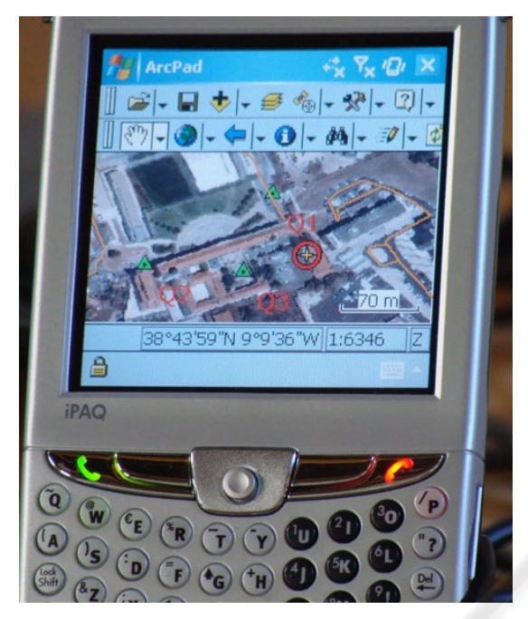
Figure 4: ArcPAD® with the information for the GIS Day2008 Geopaper.

and 16H. In each shift, there were seven teams of four or five students that received some information about GIS, GPS and how to use the ArcPad® (Figure 4).