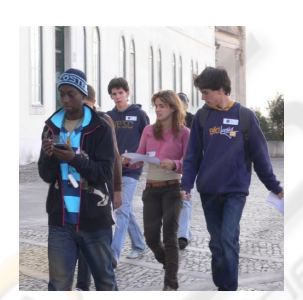
Figure 2: Geopaper activity during GIS Day2007.

One of the first activities of the ConTIG project was the celebration of GIS Day in the ISEGI-UNL campus in November 14<sup>th</sup> 2007, showing how GIT works and some of its possibilities. Students and teachers from both partner schools were present to meet each other and got to do a hands-on activity with GPS and GIS technologies. The activity consisted on a Geopaper on the ISEGI-UNL campus. The students had to find clues with the help of a GPS receiver and ESRI's ArcPad ® technology (Figure 2 and Figure 3).