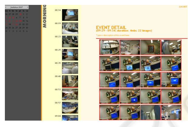
Fig. 3. SenseCam browser.

longer period. The SenseCam allowed observation of tasks for an extended period without the resource commitment normally associated with shadowing, proving itself to effective in eliciting high-level task details. The SenseCam is additionally non-intrusive into task performance. It allows the capture of points of interest without distracting users by temporarily abandoning their current activity.