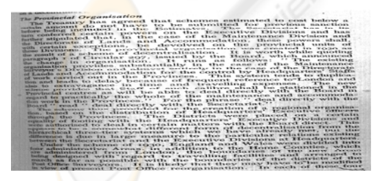
Figure 1: Document image with warp, skew and shadow along the spines.

While scanning a thick volume, a major problem often faced is warping along the spine of the volume which hampers the readability of the scanned text image. Also, if we want to process the text image consisting of such problems with an OCR, then the performance of the process degrades considerably. The problems discussed here can also be seen while photocopying a thick volume. This paper proposes an effective method to solve this problem in a manner that is independent of the script and also does not make any assumptions about the nature of the distortions.