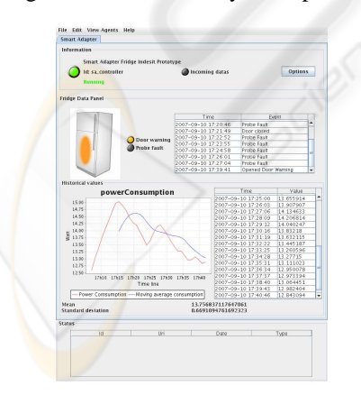
Figure 3: Information gathered from the refrigeratorembedded information device displayed on a product agent's user interface.

We have been involved the development one of the PROMISE technology demonstrators, in which support for data gathering from an intelligent refrigerator's statistical data collection unit was integrated to the PMI-Dialog messaging system. The refrigerator prototype was provided by Indesit, a major European domestic appliance manufacturer, and has functionality similar to what can be expected of smart household appliances available in the near future. By integrating to the refrigerator a device capable of collecting, storing and communicating statistical data obtained from the various embedded sensors, the manufacturer plans to enhance final product testing performance at the manufacturing plant, as well as the possibility of offering a preventive maintenance service contract to customers. This latter business scenario is the most interesting from a distributed systems point of view.