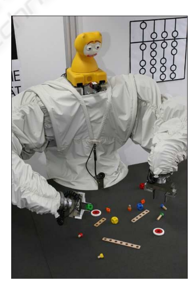
Figure 1: The JAST human-robot interaction system.

Vision processing in the JAST system (Figure 1) is performed on the output of a single camera, which is installed directly above the table looking downward to take images of the scene. The camera provides an image stream of 7 frames per second at a resolution of 1024 \times 768 pixels. The output of the vision process (recognized objects, gestures, and parts of the robot) has to be sent to a multimodal fusion component, where it is combined with spoken input from the user to produce combined hypotheses represent-