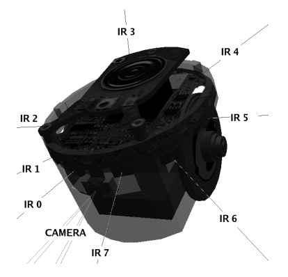
Figure 1: A simulated e-puck robot.

The test problem used here consists of a virtual e-puck that must navigate around a building with three rooms (see Figures 2 and 3) by tracking blue markers painted on the walls. These markers are intended to guide the robot through the doors, which close automatically once the robot has passed through. The course is completed once the robot has crossed the finish-line in the third room, and its performance is measured according to how quickly it can achieve this goal, and how many times it collides with the walls or obstacles placed in the rooms. Two different test environments are used; World 1 (see Figure 2) has fewer obstacles and no other robots. World 2 (see Figure 3) contains more obstacles, and there is also a dummy wanderingrobot in each room.