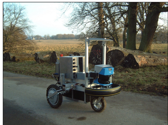
Figure 1: The robot platform tested in the dirt-road semi-structured environment from a Danish national park

point clouds into linear features, surfaces, and scatter. Classification was based on a learnt training set. Montemerlo and Thrun (2004) identified navigable terrain using a 3D laser scanner by checking if all measurements in the vicinity of a range reading had less than a few centimetres deviation. Wallace et al (1986) used a vision-based edge detection algorithm to identify road borders. Jochem et. Al (1993) followed roads using vision and neural networks. Macedo et al (2000) developed an algorithm that distinguished compressible grass (which is traversable) from obstacles such as rocks